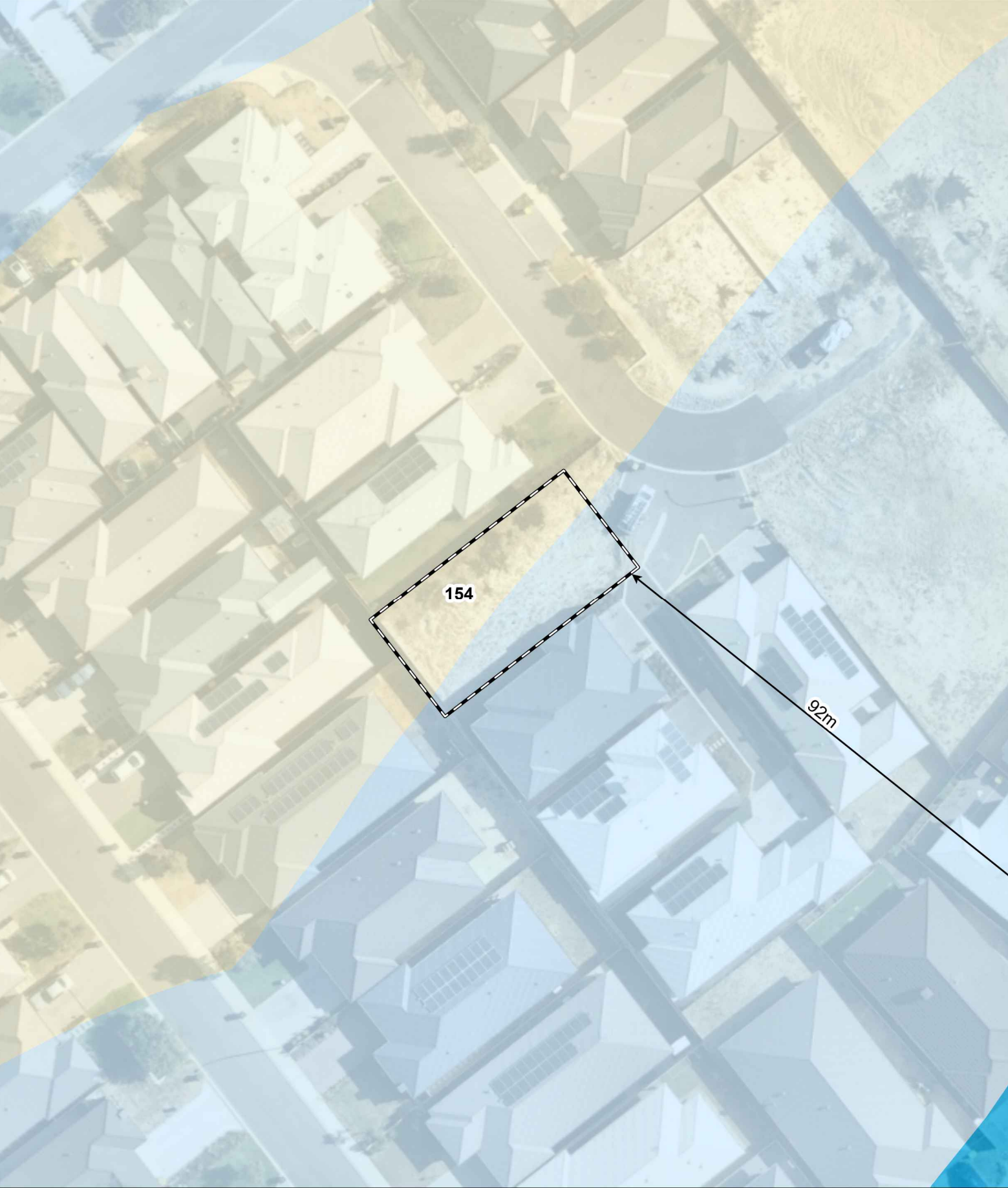
Figure : Bushfire Attack Level (BAL) Contours - Lot 154 (*BAL - 12.5)